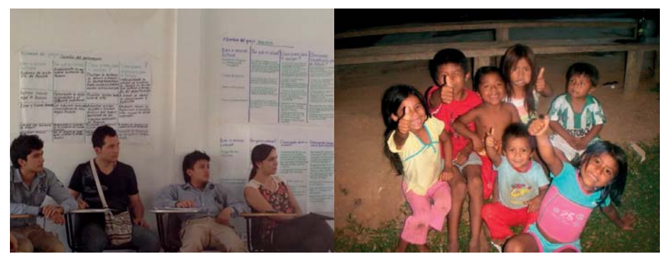
Workshop in Arauca, Arauca. 2013.

They proposed develop a programme towards cultural heritage sensitization which was applied to children in kindergartens, using puppets and workshops where were used the book "Introducing young people in the care of cultural heritage.